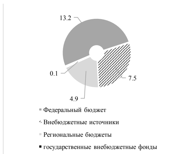
Fig. 1. Share of the budget for the implementation of priority national projects (trillion rubles).

The total amount of funds supposed to be allocated for the implementation of the programs amounted to 25.7 trillion rubles, 13.2 trillion rubles will be allocated from the federal budget, 7.5 trillion rubles from extra-budgetary sources, from regional budgets - 4.9 trillion rubles, remaining the traditional risks of implementing programmes include difficulties in financing priority national projects through extra-budgetary funds, especially through funding from regional budgets, most of which are subsidized.