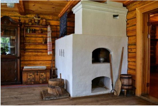
Figure 1 Photo of the Russian stove from an open source

It should also be noted that the house is called a house of logs – pine, oak, cedar, larch. He is the most comfortable, because he "breathes" and has a beneficial effect on